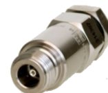
OMNI FIT™ Premium Connectors

OMNI FIT™ high performance connectors are designed for use with both CELLFLEX® (copper) and CELLFLEX® Lite (aluminium) cables. They are designed specifically to provide the highest quality connector-cable interface while simplifying and speeding up connector attachment. All RFS connectors are fully tested for mechanical and electrical compliance to industry specifications. The N connector meets all technical requirements and covers high frequencies as well as legacy applications. Sealing against outer conductor and jacket by means of threaded gasket and 360° compression fit. Multifunctional, self-lubricating HighTech polymer assembly locks on cable corrugation, avoids electrochemical potential differences and compression-fits to the jacket.;